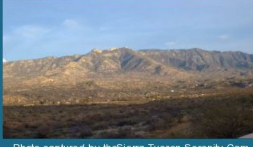
Photo captured by the Sierra Tucson Serenity Cam

Don't forget to Save the Dates for the Sierra Tucson Alumni Retreat (S.T.A.R. 31) : Oct. 11-14, 2018!