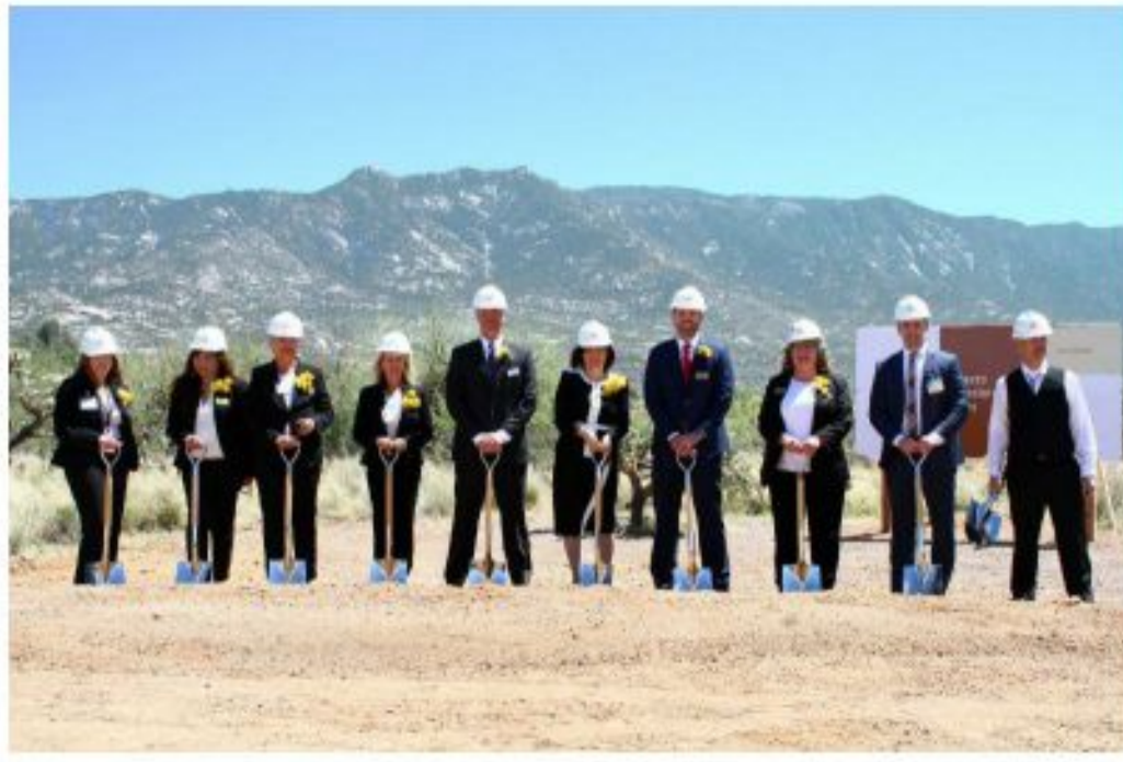
Sierra Tucson's Groundbreaking Ceremony on April 4

Recently, Sierra Tucson hosted a Groundbreaking Ceremony to celebrate the start of its expansion project, "Growing Our Miracle." The new Behavioral Health Inpatient Lodge will allow Sierra Tucson to provide comprehensive treatment to 44 more residents and their families. You can find photos from the magnificent ceremony on our Facebook page .